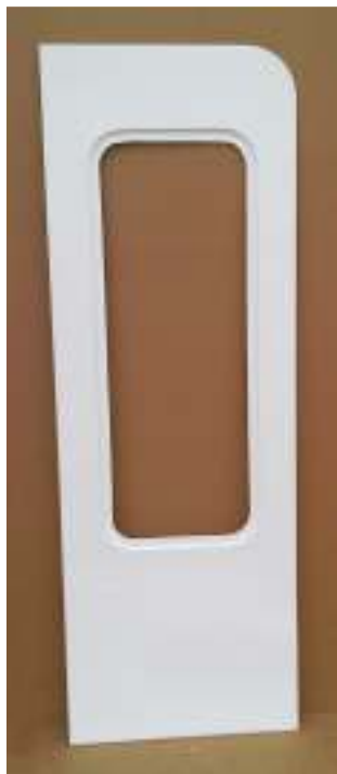
Pre 2006 Rear Door Skin (Outer) LHS Door panel 3008450 RHS Door panel 3012500