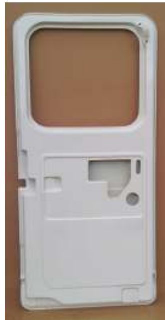
Sliding Door Skin Inner Panel 3003150