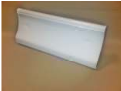
Step Finisher 5251925