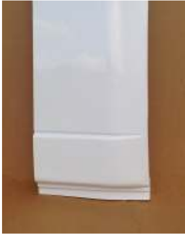
OSF Pillar Panel 2006 – on VW/MERC 5372745 2006 – on Transit 5372735 Pre 2006 – Call for details