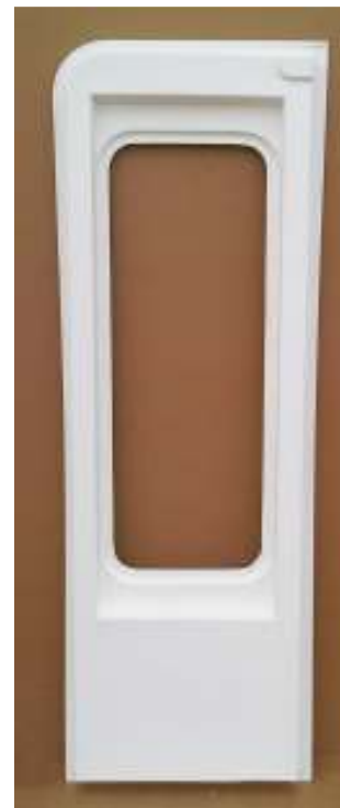
Pre 2006 Rear Door Skin (Inner) LHS Door panel 3009975 RHS Door panel 3012475