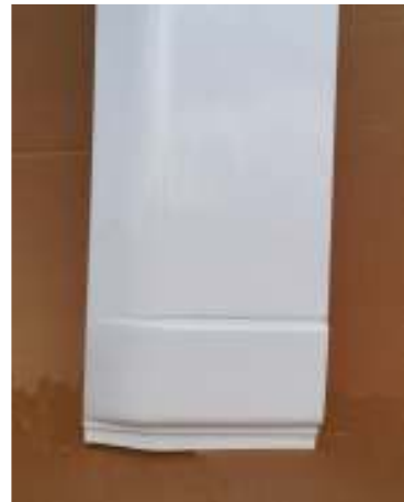
NSF Pillar Panel 2006 – on VW/MERC 5372740 2006 – on Transit 5372730 Pre 2006 – Call for details