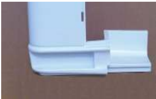
NSR Panel 3002900 Pre -2006