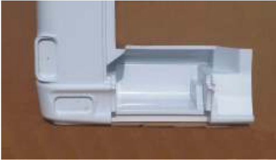
NSR Panel 3007830 (2006 - on)