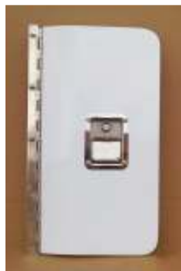
Spine Door Skins: OSF Outer 3008675 OSF 3008650 NSF Outer 3008625 NSF Inner 3008600