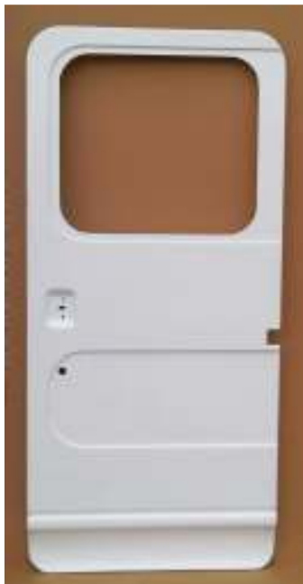
Sliding Door Skin Outer Panel 5384000