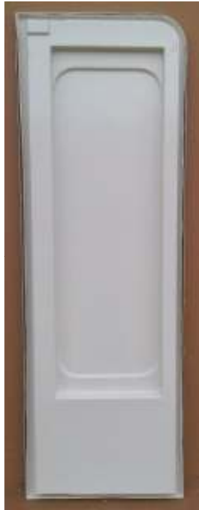
Rear RHS Door (2006-on) RHS Inner panel 3008475