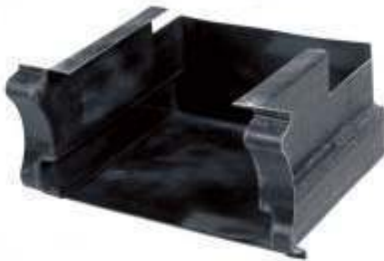
Battery Box 5074275