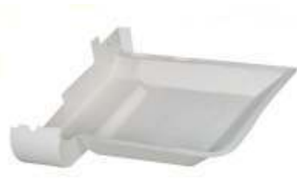
Motor Transmission Cover 5034299