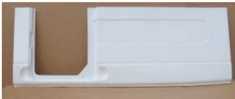
RH Side Panel 5073250 LH Side panel 3008425