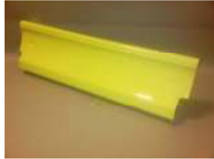
Ramp Finisher 5251925