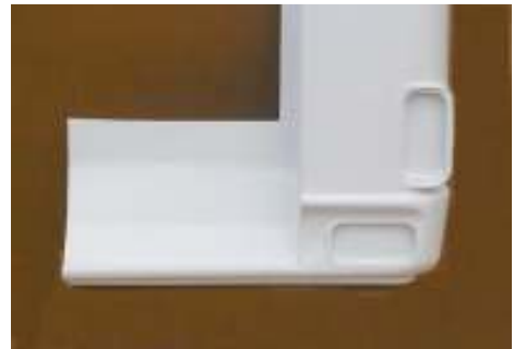
OSR Panel 3007835 (2006 - on)