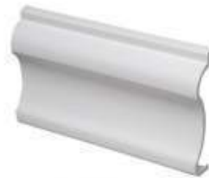
Batter Access Door 5203925