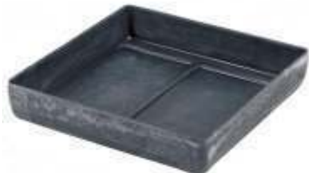
Battery Drawer 5074225