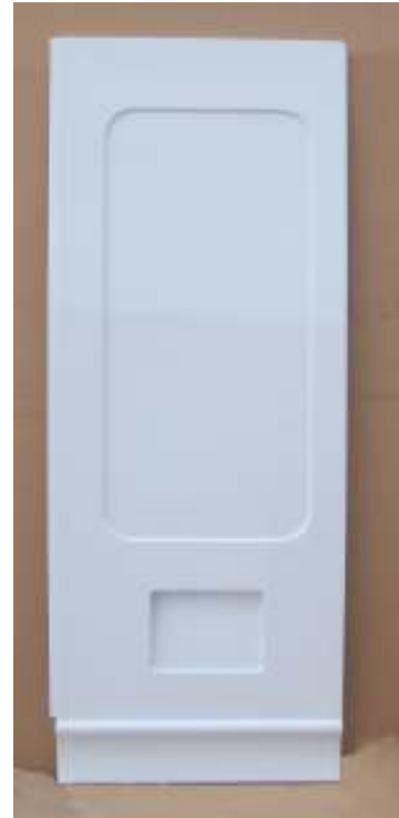
Ramp Door Cover 3008550