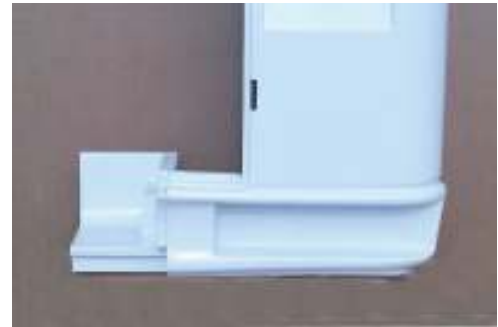
OSR Panel 3002875 Pre -2006