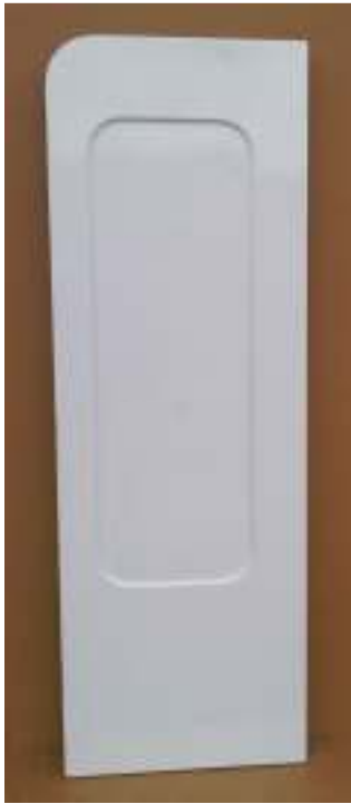
Rear RHS Door (2006-on) RHS Outer panel 300845