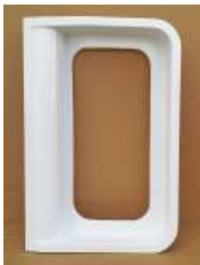
OSF Door Aperture 3012325 NSF Door Aperture 3012300